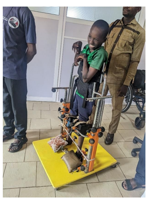
Posture control session with a sit-to-stand device