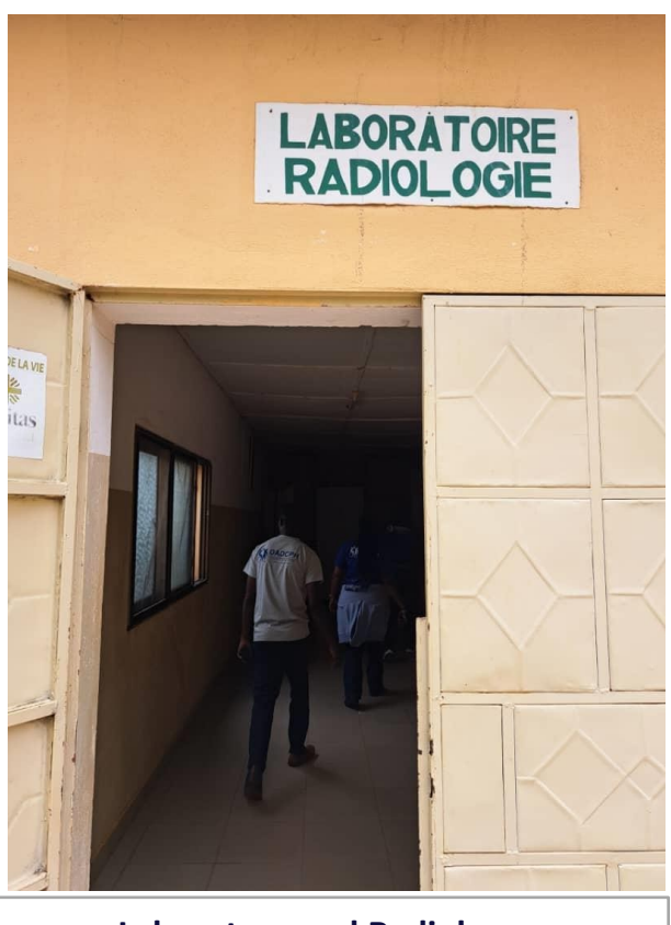
Laboratory and Radiology