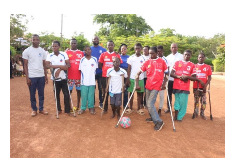
"When assistive technologies put a smile back on people's faces a football match