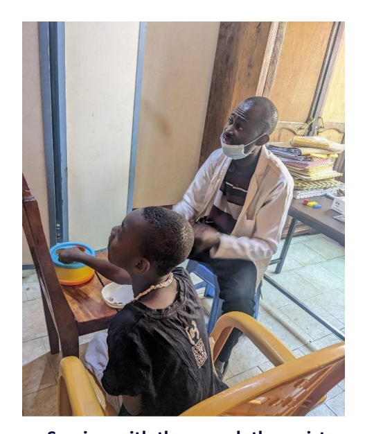
Session with the speech therapist