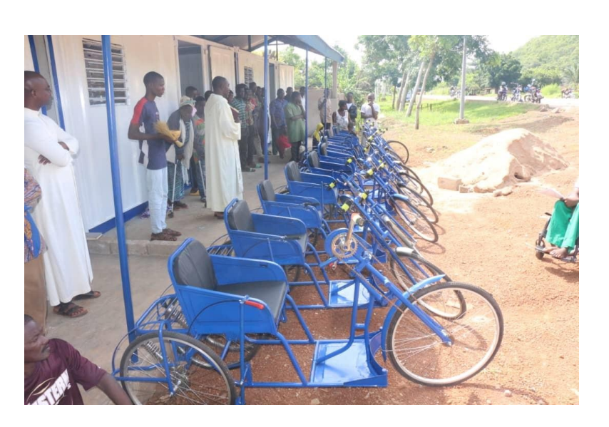
Some tricycles made in