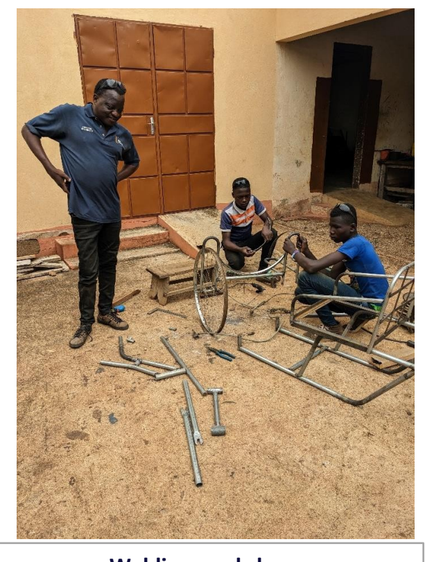
Welding workshop (2) Publish | News feed | LinkedIn