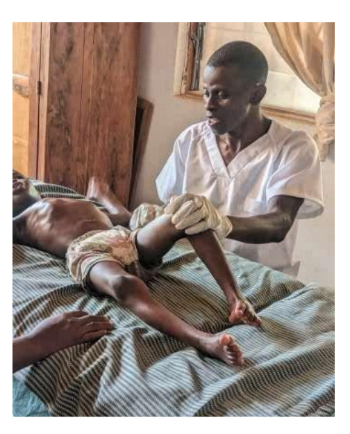
Session with the psychomotrician